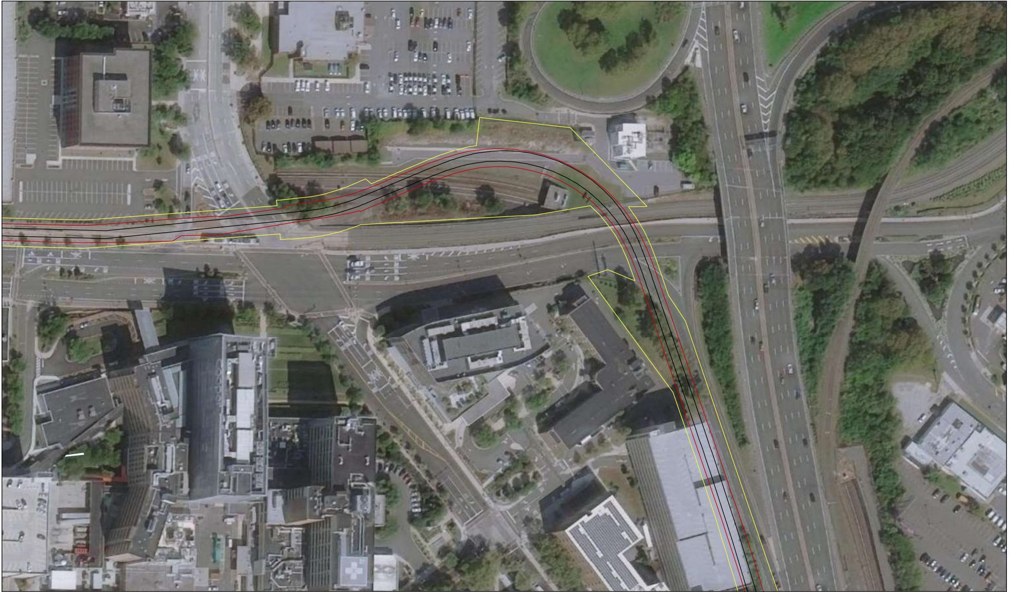
Figure 1: Relationship Between Limit of Proposed Features (LOPF) and Limit of Disturbance (LOD)